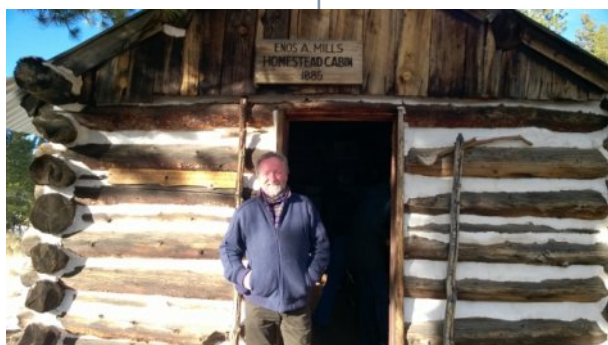
Enos Mills Cabin