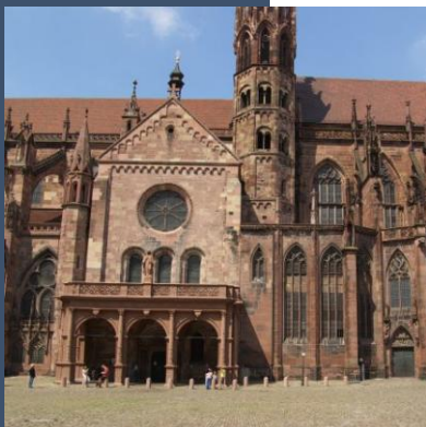
The Muenster in Freiburg

The programme for Interpret Europe's first annual conference is very exciting. It's full of interest for everyone with lively classroom sessions and workshops, relevant site visits and plenty of time for networking. We're delighted with the number of interpreters who wish to hold sessions and run workshops at the conference.