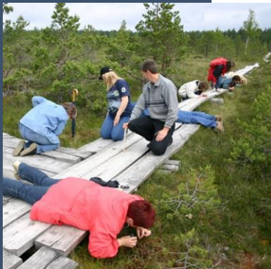
Interpreters reveal what is easily missed (here in Latvia's nature)