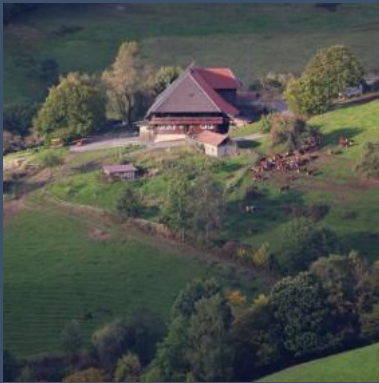
Black Forest is calling...

In many parts of the World mountain tourism has become a well-recognised aspect of the culture; certainly in Europe, mountain tourism as a social activity has a history extending back more than 200 years. During this